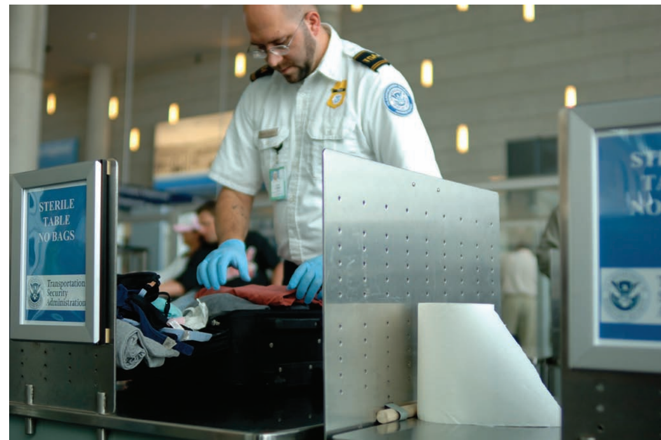
Fig. 3: Airport customs agent.

Archaeologists and cultural bureaucrats claim that import restrictions are justified because they assert that unprovenanced artifacts are likely recently looted. However, that is simply not a valid assumption for ancient coins. Ancient coins have been avidly collected since the Renaissance. Few coins are sold with any detailed collecting history because of the costs involved in establishing it. And frequently, what basic information about a coin's collecting history is provided tends to get lost over time. Thus, though it is unreasonable to assume that any coin that lacks an ownership history "must be recently looted," that unfortunately is the exact presumption the law now makes for Chinese, Cypriot and Italian coins now on the CBP's "designated list."