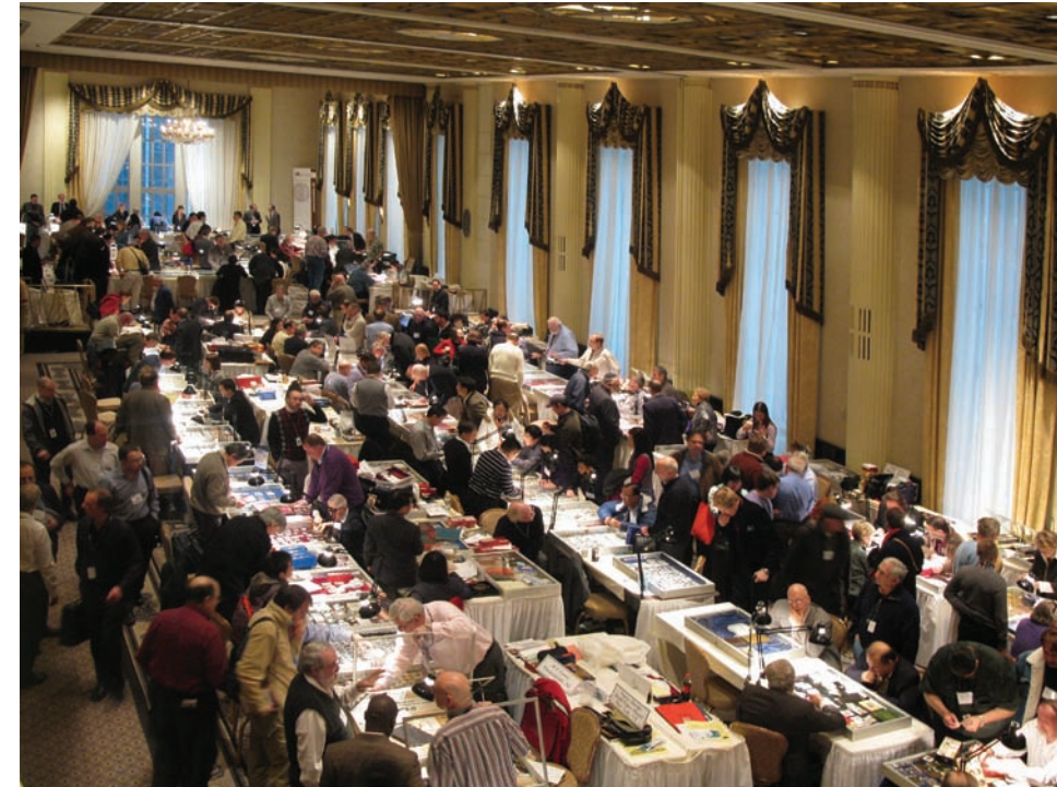
Fig. 1: A typical coin show bourse.

A: Some countries do allow trade in duplicates, including Israel. But it is difficult to identify a duplicate from a country that allows trade, and it's difficult to prevent the sale of new objects as duplicates. Furthermore, most museums and private collectors are interested in high-