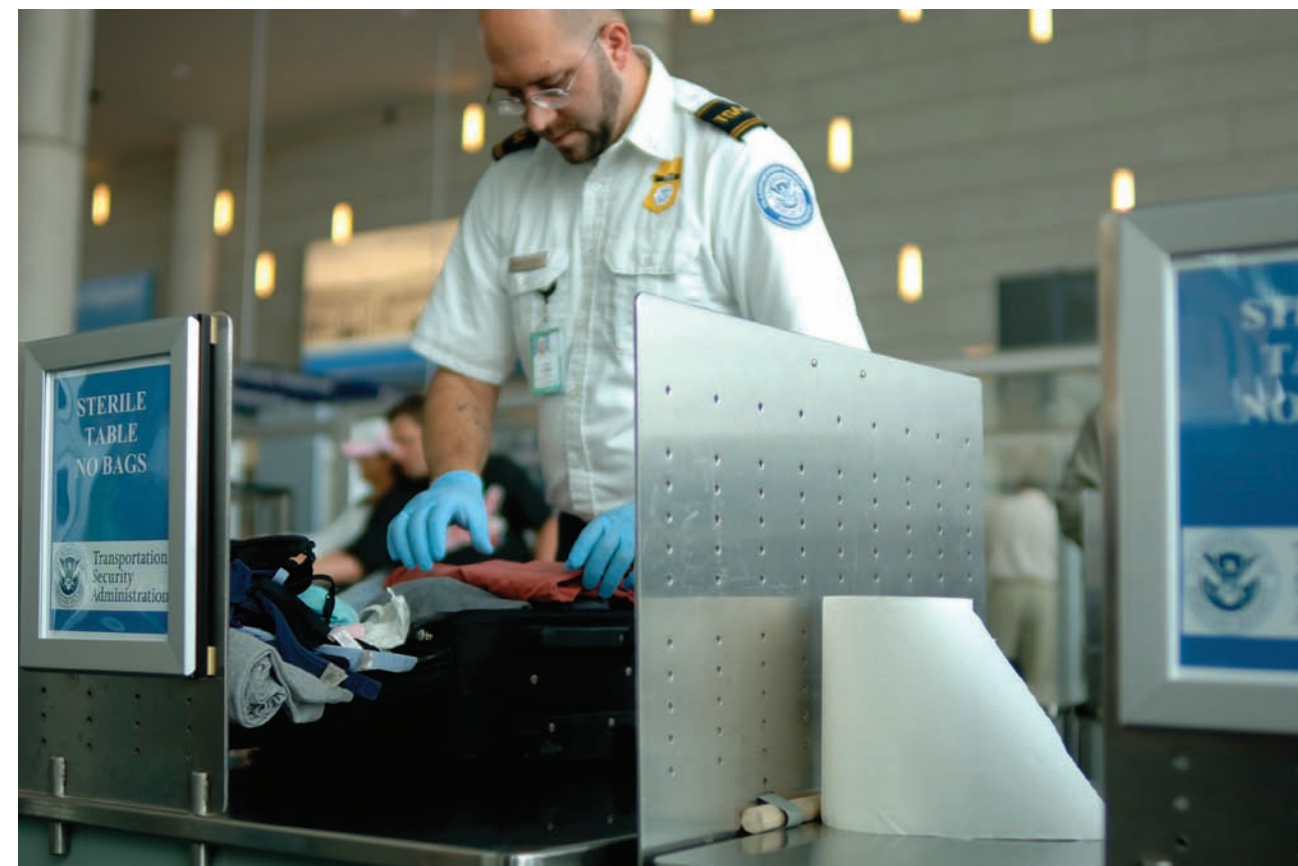
Fig. 3: Airport customs agent.

Archaeologists and cultural bureaucrats claim that import restrictions are justified because they assert that unprovenanced artifacts are likely recently looted. However, that is simply not a valid assumption for ancient coins. Ancient coins have been avidly collected since the Renaissance. Few coins are sold with any detailed collecting history because of the costs involved in establishing it. And frequently, what basic information about a coin's collecting history is provided tends to get lost over time. Thus, though it is unreasonable to assume that any coin that lacks an ownership history "must be recently looted," that unfortunately is the exact presumption the law now makes for Chinese, Cypriot and Italian coins now on the CBP's "designated list."