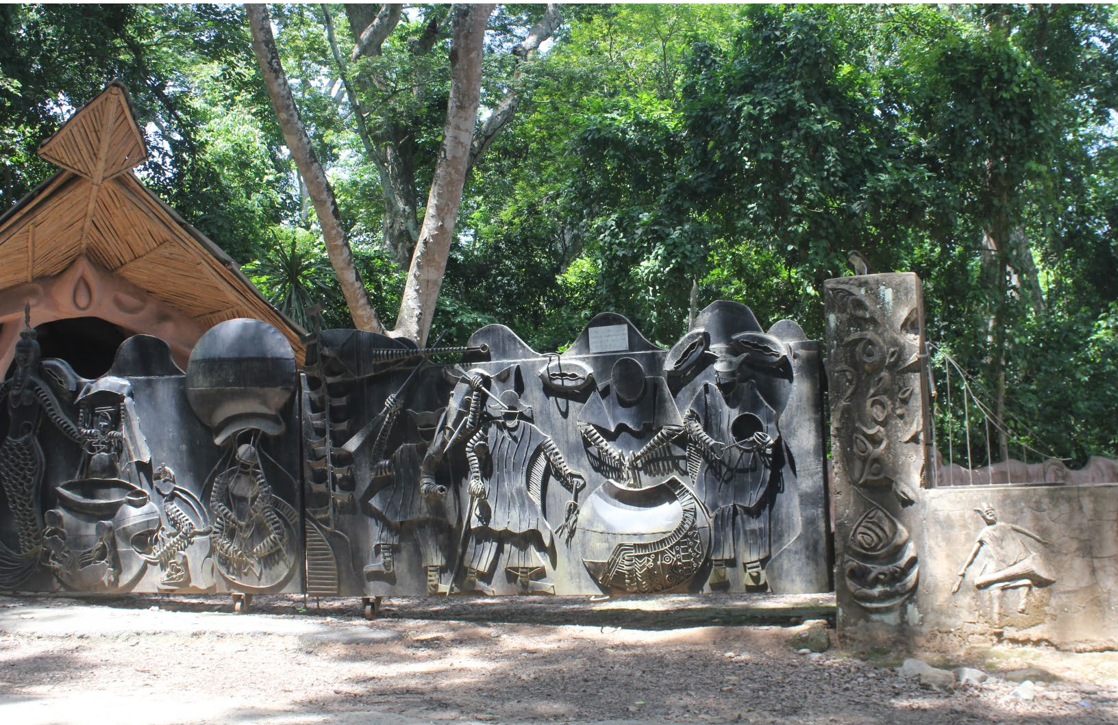
Osun Sacred Grove Forest, Osogbo Main Gate.

Yes, Nigeria through the NCMM participates in international efforts to preserve cultural property in other nations. Nigeria has two internationally approved UNESCO World Heritage Sites, which are Sukur Cultural Landscape in Adamawa State and Osun Osogbo Sacred Grove in Osun State. The NCMM is a member of the ICOM and works with it to keep up with best museum practices.