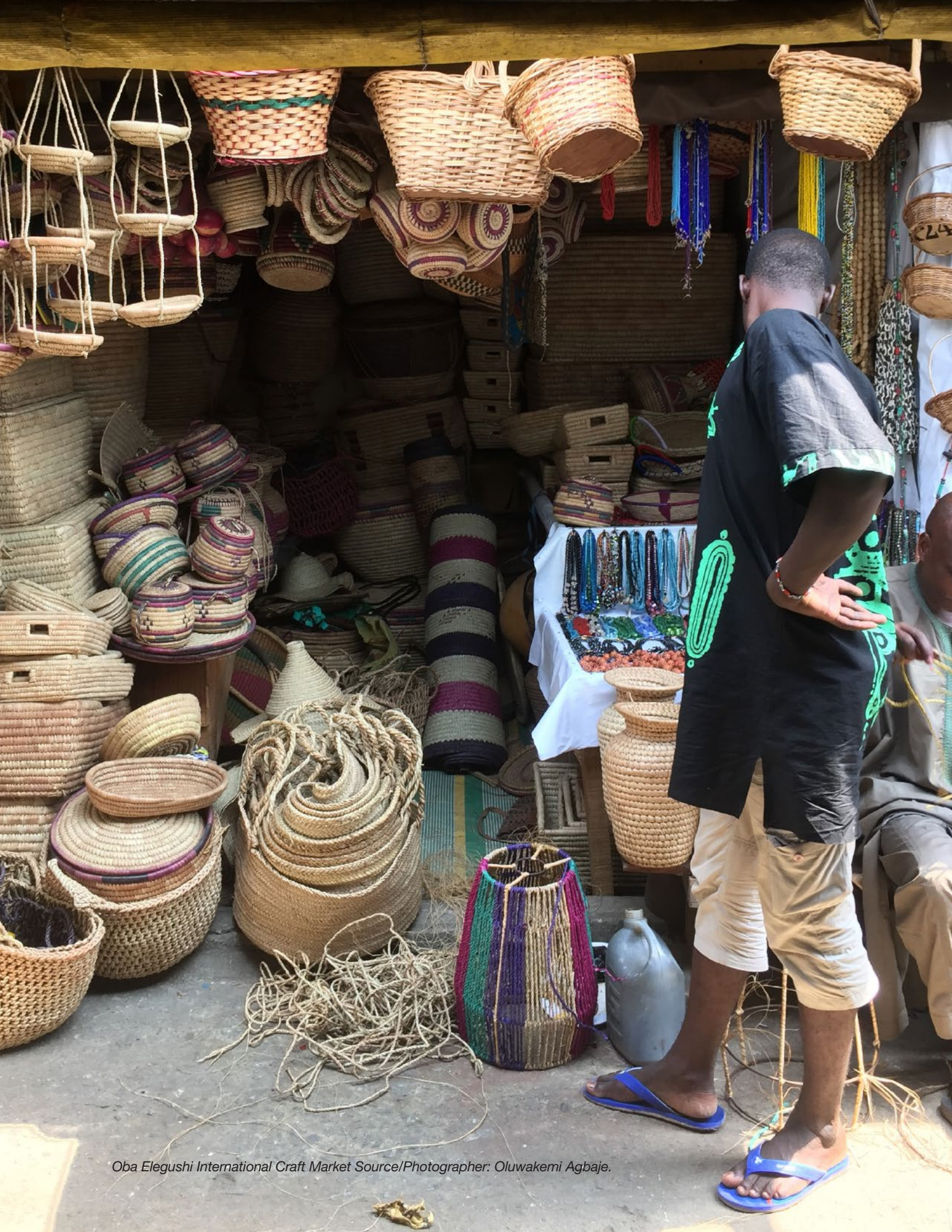
Oba Elegushi International Craft Market