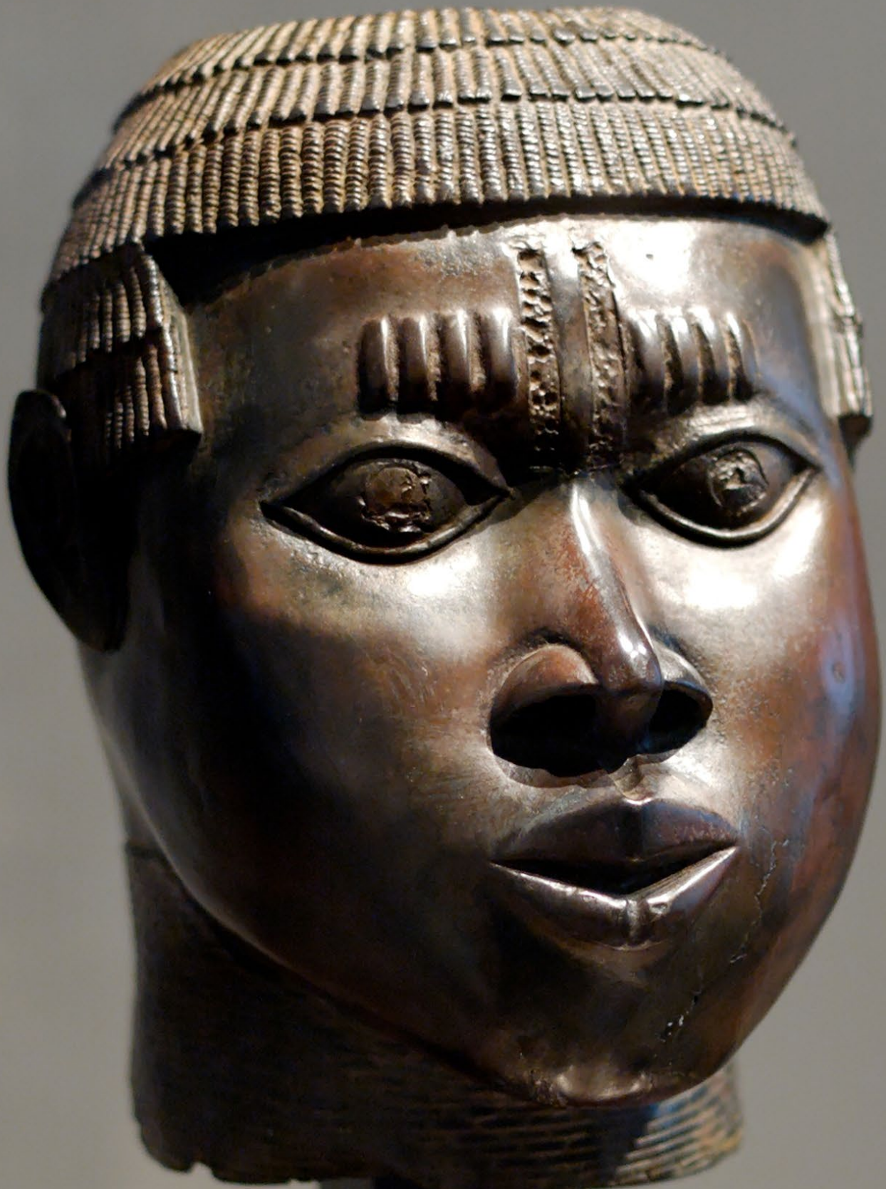
The Benin Bronze Head dates back as far as the 15th middle, 16th Century