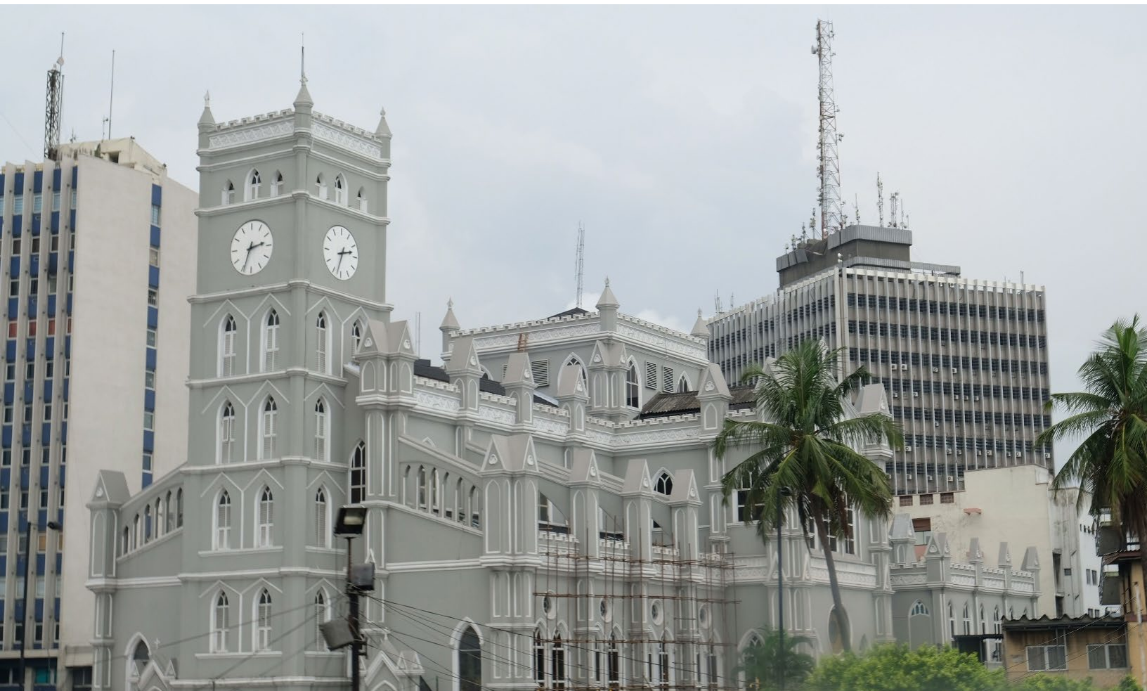
The Cathedral Church of Christ is an Anglican cathedral located in Lagos Island, Nigeria. The first stone for the foundation of the first cathedral building was laid on 29 March 1867 and was completed in 1869. The construction of the current building, however, commenced on 1 November 1924 and it was patterned after the designs by Architect Bagan Benjamin. The first stone of the current building was laid by the Prince of Wales on 21 April 1925 and the cathedral was completed in 1946.