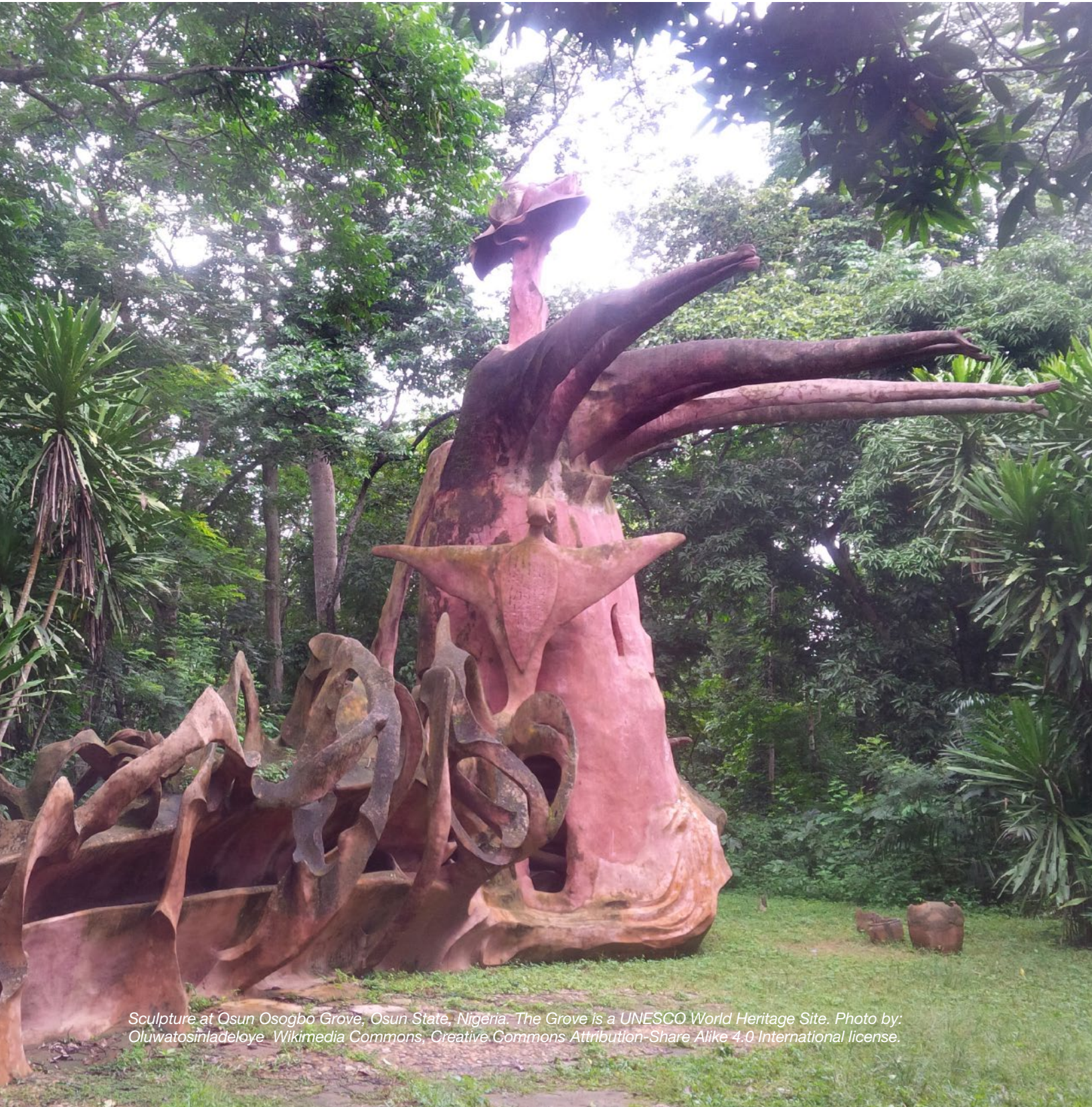
Sculpture at Osun Osogbo Grove, Osun State, Nigeria. The Grove is a UNESCO World Heritage Site.

Yes, there are some private collections of Cultural Property in Nigeria. Two of the largest well-known private collections are owned by Omooba Oluyemisi Shyllon and Professor Wole Soyinka respectively. Omooba Oluyemisi Shyllon is said to have the largest private collection in Africa with over 7,000 artworks of sculptures, paintings, other media , as well as over 55,000 photographic shots of Nigeria's fast disappearing cultural festivals valued in billions of Naira, collected over a period of about 40 years.