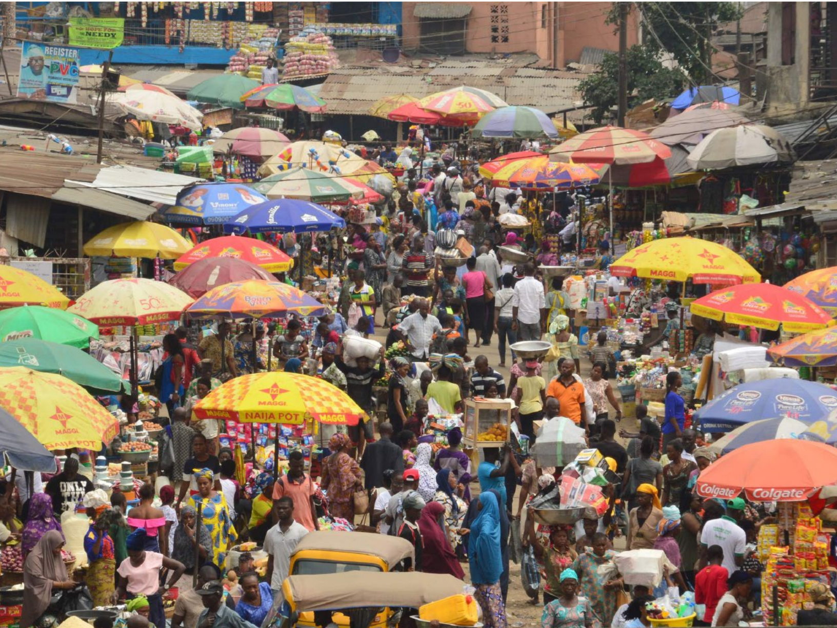
Buying and selling in Mushin Oloosa market, Lagos-Nigeria, Author Omoeko Media, 19 November 2018, Creative Commons Attribution-Share Alike 4.0 International license.

in writing by the Minister charged with responsibility for antiquities, museums and national monuments 17 to act for the NCMM in the State concerned.